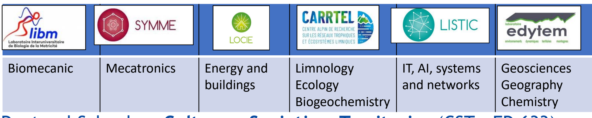
Doctoral School on Cultures, Societies, Territories (CST - ED 633)